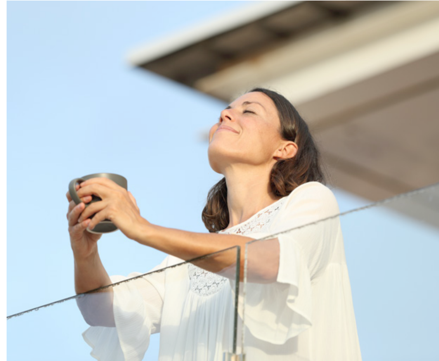
Sun shading elements (balconies & perforated panels)

Extensive landscaping with native plants or adaptable species enhances the property's beauty and value while reducing its environmental impact. Other environmentally friendly features include advanced waste management and water reuse solutions, as well as a bicycle storage area and EV parking to encourage residents to use less traditional combustion engines.